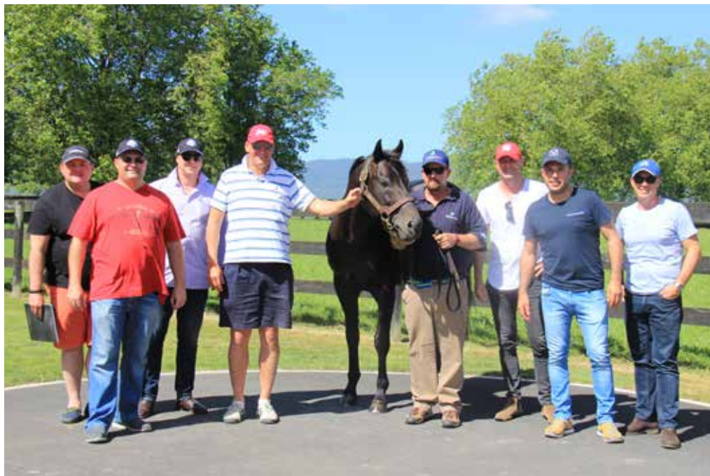
2016 MITHO TOUR