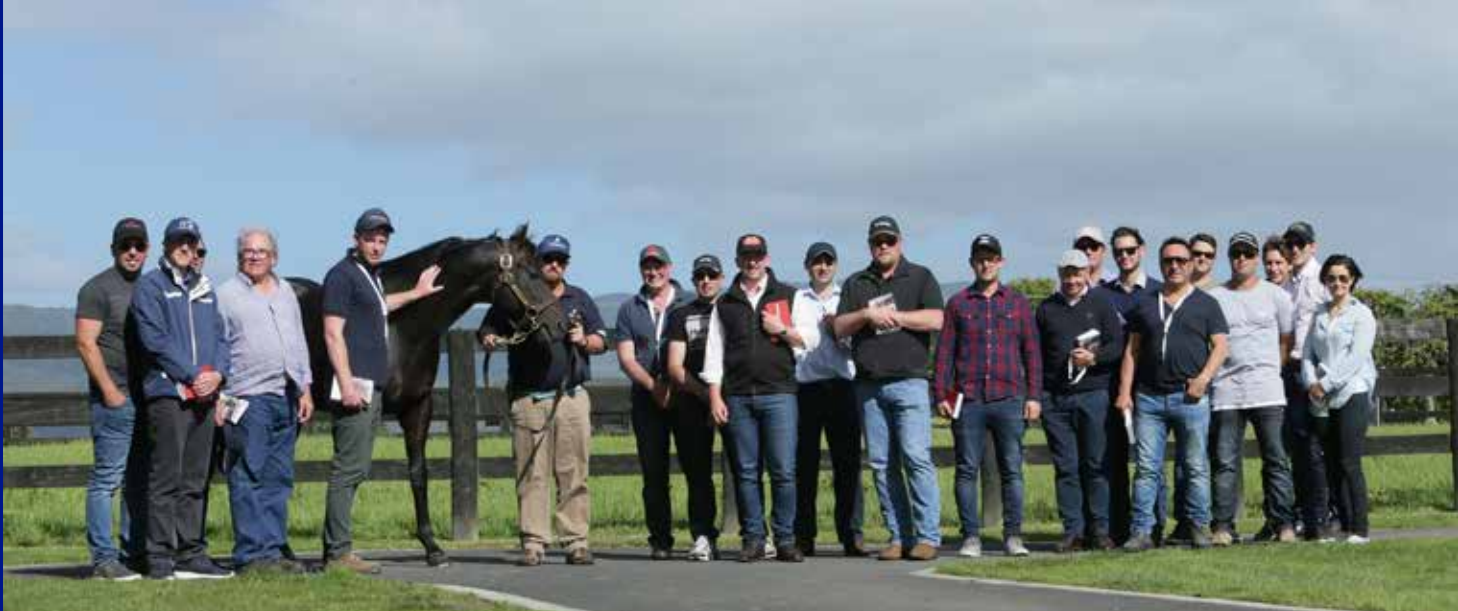
2016 NZTM AUSTRALIAN TRAINERS' TOUR