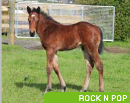
ROCK N POP