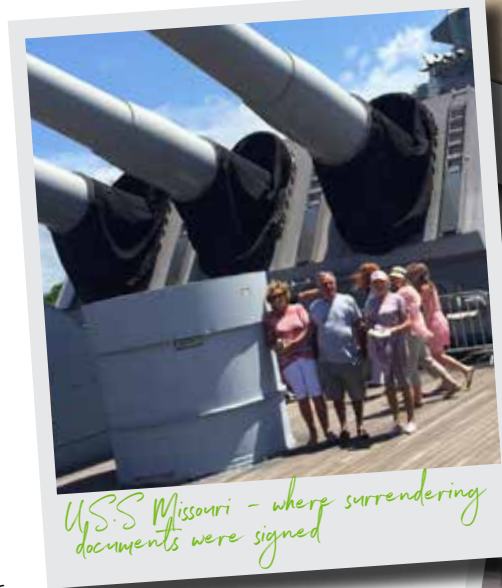
USS Missouri - where surrendering documents were signed