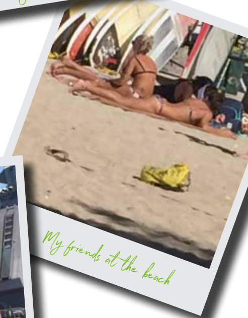
My friends at the beach